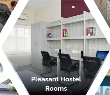
Pleasant Hostel Rooms