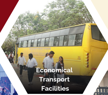
Economical Transport Facilities