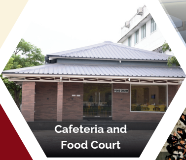
Cafeteria and Food Court