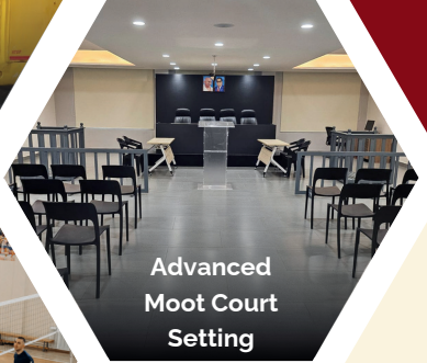
Advanced Moot Court Setting