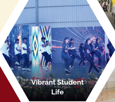
Vibrant Student Life