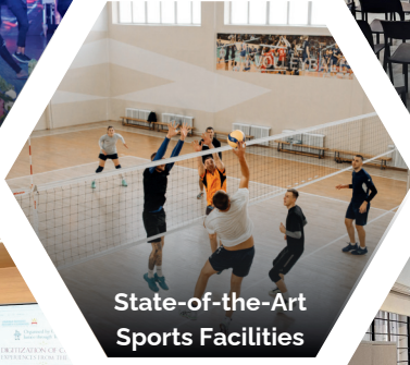
State-of-the-Art Sports Facilities