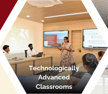
Technologically Advanced Classrooms