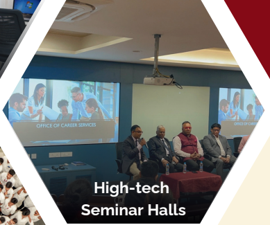
High-tech Seminar Halls