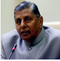
Justice BS Chauhan

Former Judge Supreme Court of India, Former Chairman, Law Commission of India.